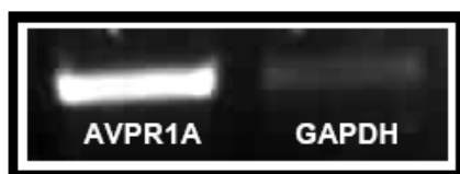
Fig.1. AVPR1A and GAPDH housekeeping gene RT-PCR.

Our expression plasmid contains the coding sequence of human AVPR1A receptor protein. Our plasmid was transfected in HEK293 cells. Resistant clones were obtained by limit dilution and receptor gene expression was tested by RT-PCR using GAPDH as internal control (Fig.1).